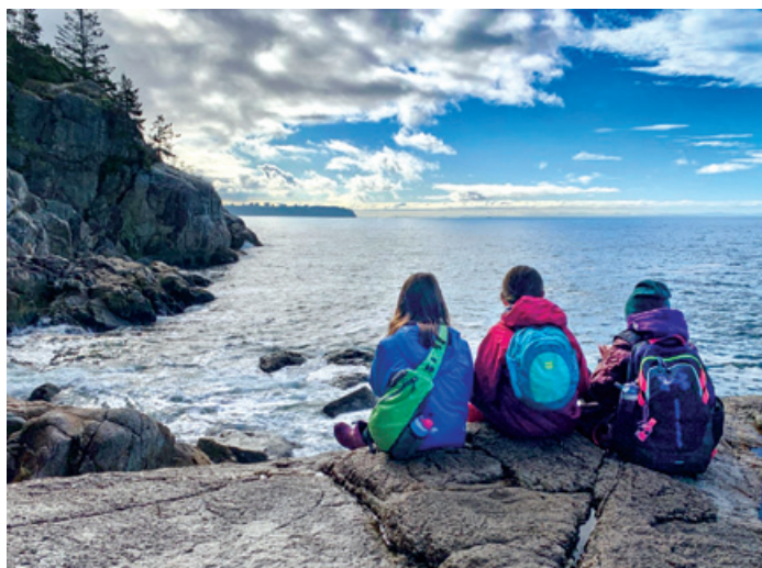
Some members of the 34th Vancouver Guides, West Coast Area , enjoyed the sights and the sounds of Lighthouse Park in West Vancouver.