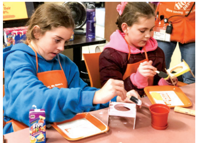
2nd Parksville Guides and 2nd Arrowsmith Pathfinders of Pacific Shores Area

visited Nanaimo Home Depot. The day was an exercise in overcoming frustrations and helping one another as this is a diverse, multi-branch unit with a broad range of ages and capabilities. Everyone learned a lot and had a great time!