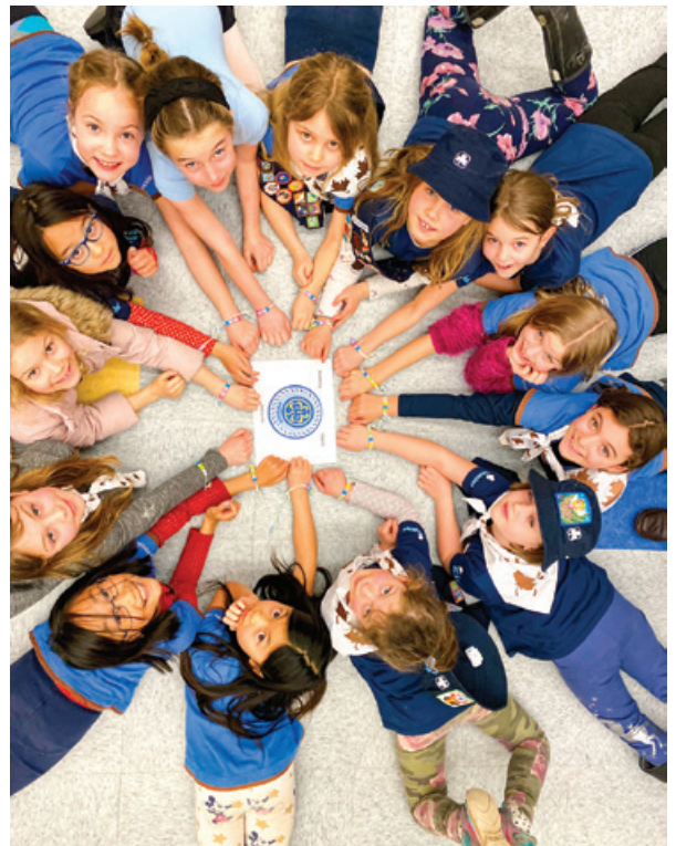
49th Brownies of West Coast Area are proud to wear their own WTD2020 bracelet.