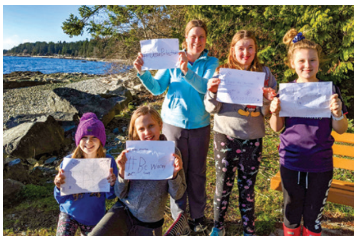
The 1st Roberts Creek Guides, Lions Area, did a beach cleanup at Camp Olive during their recent camp.