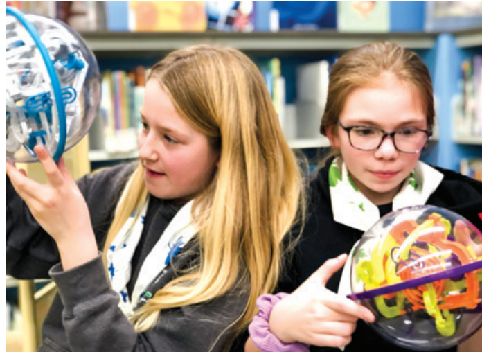
The 2nd Parkville Guides and 2nd Arrowsmith Pathfinders, Pacific Shores Area, enjoyed and explored the Parkville branch of the Vancouver Island Regional Library.