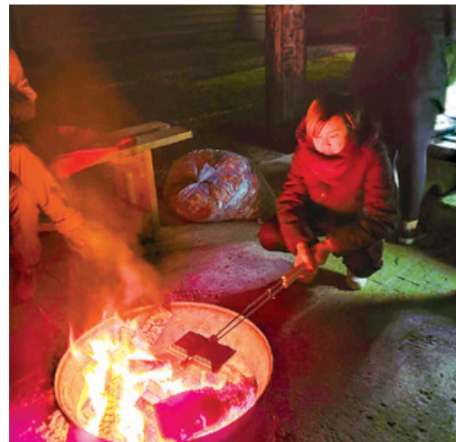
The 1st Ottergrove Rangers, Fraser Skies Area , enjoyed a “chill” camp at beautiful Camp McLanlin and introduced their new international exchange members to camp pies. Yum!