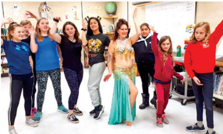
The 1st Roberts Creek Guides and 1st Roberts Creek Pathfinders, Lions Area , enjoyed an evening of belly dancing.